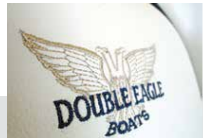
Premium Embroidered Seating